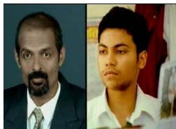
Learner at Centre asking the question to the Faculty