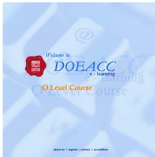
Front Page of E-Learning materials of DOEACC Society' O' Level Course